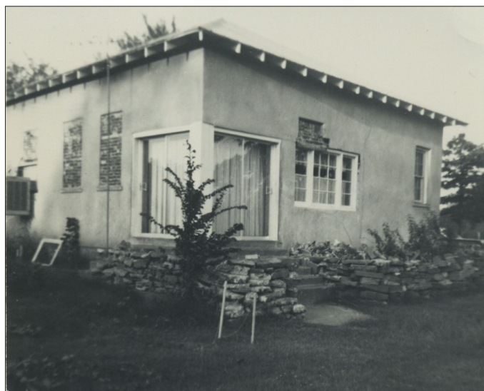
Southwest corner of house.