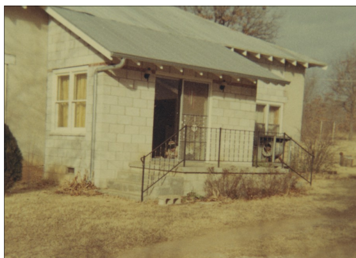
Room Addition on East side of house