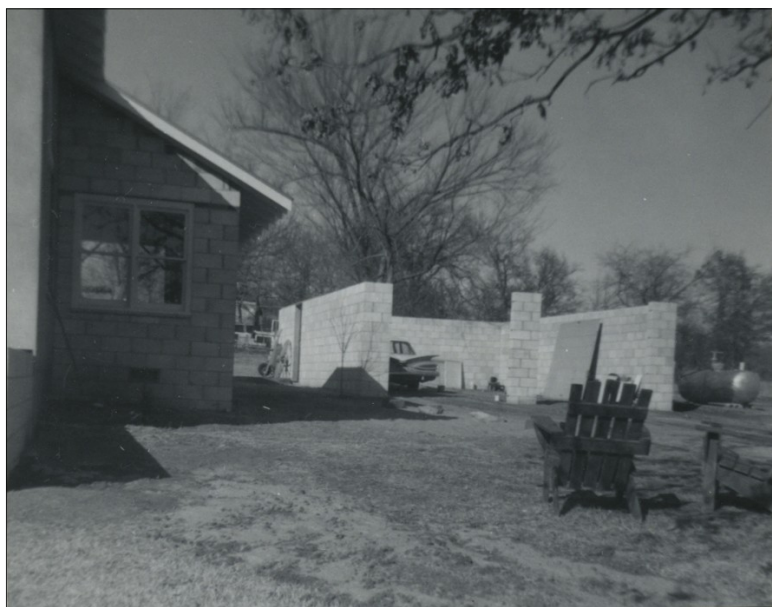
Garage being added on east side of house.