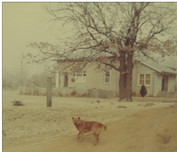
The family dog, Lady, on south side of house.