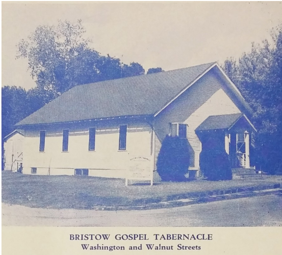
BRISTOW GOSPEL TABERNACLE Washington and Walnut Streets